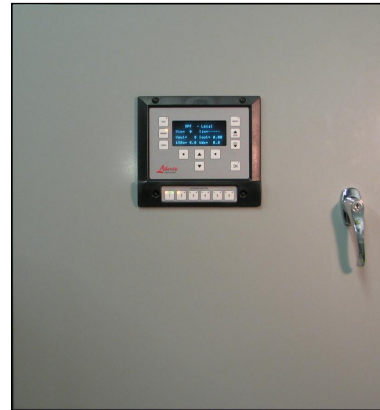
Fig. 1 Door with digital operator display interface.