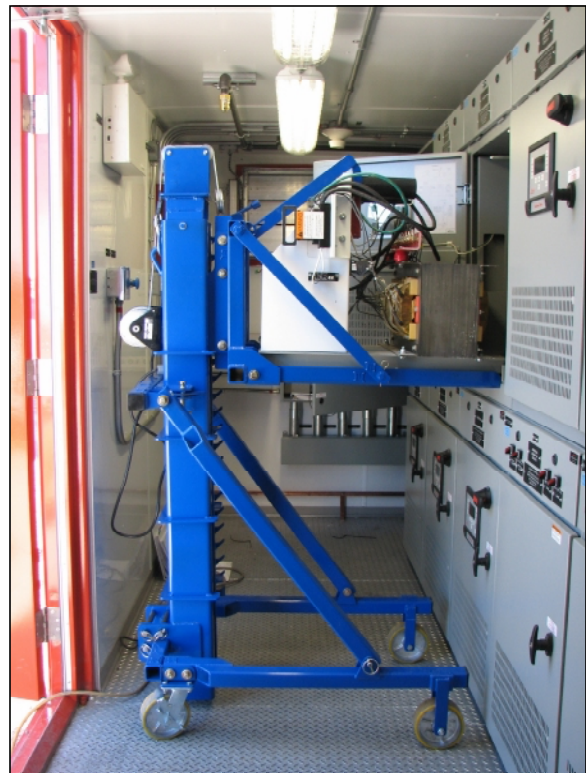
Fig. 3 24" Power Lift shown with 10KW Powerpack.