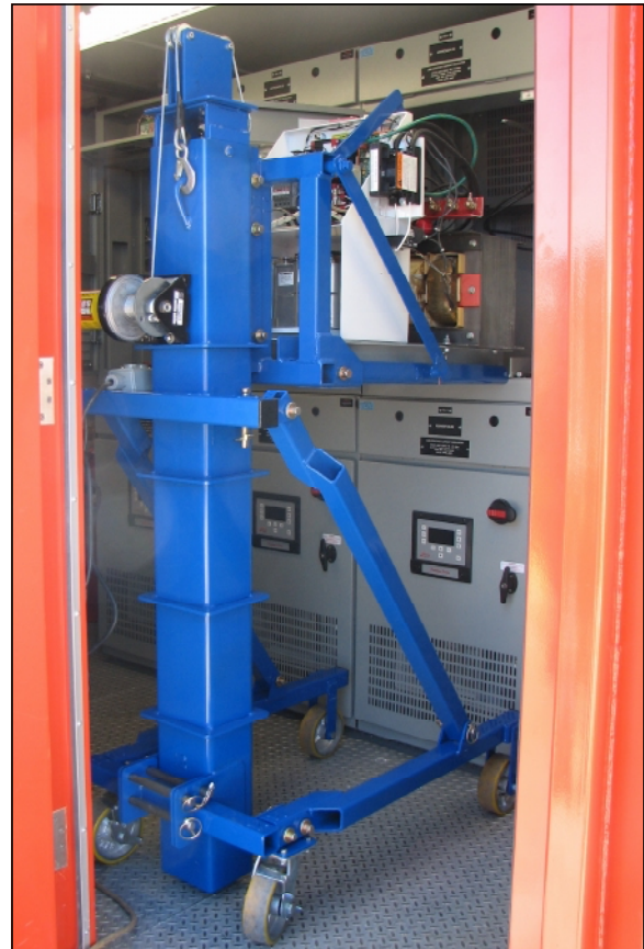
Fig. 1 24" Power Lift installing a 10KW ferroresonant power pack inside an Airfield Lighting Field Electrical Center.