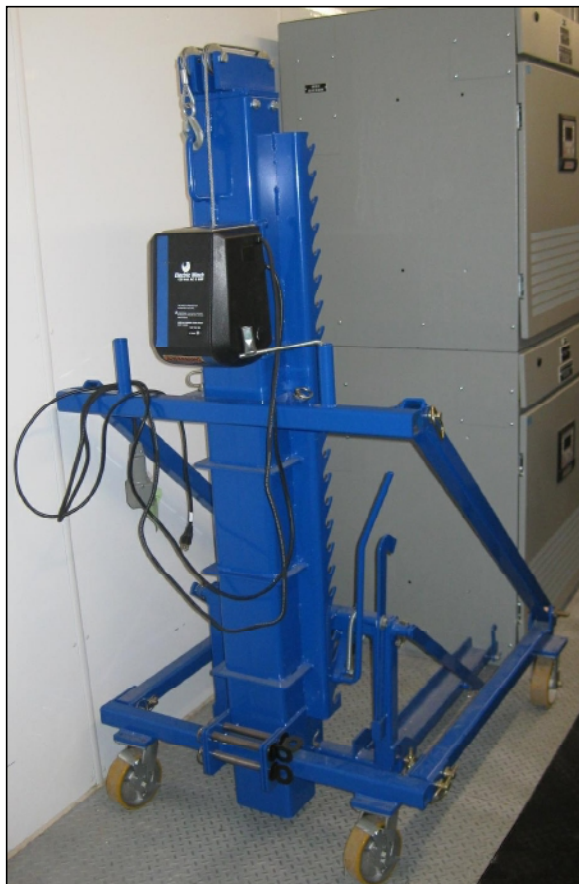
Fig. 2 36" Power Lift next to Switchgear Regulator Assembly