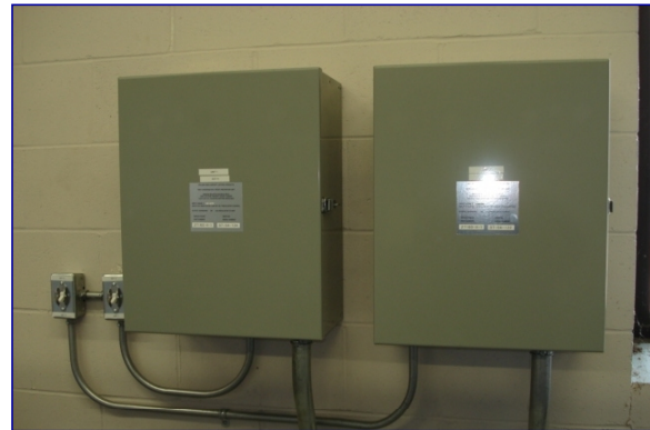
Fig. 1 Two Type A PAPI Heater Cabinets, 5KV, suitable for installation on CCRs rated up to 30KW with Circuit Selectors.